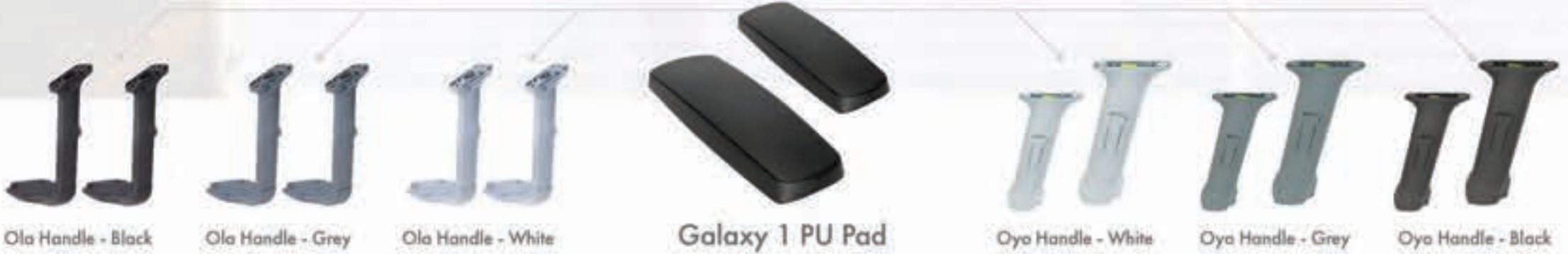
Ola Handle - Black