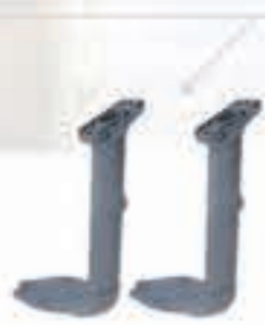
Olo Handle - Grey