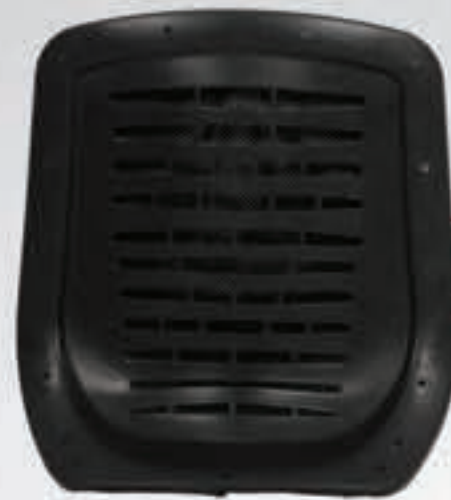
MESH BACK WITH HANDLE