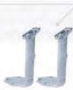
Olo Handle - White