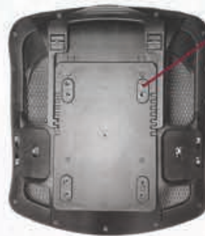
MESH SEAT WITH SEAT SLIDER