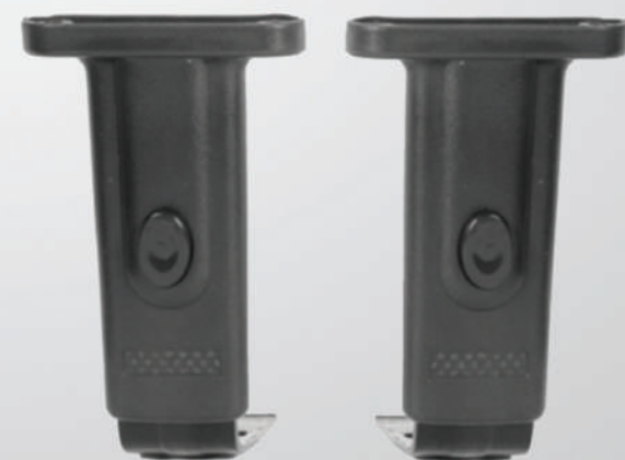
NEW ADJUSTABLE HANDLE