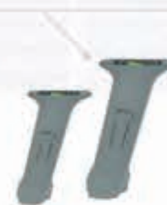
Oyo Handle - Grey