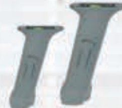
Oyo Handle - Grey