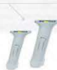
Oyo Handle - White