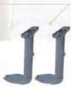
Olo Handle - Grey