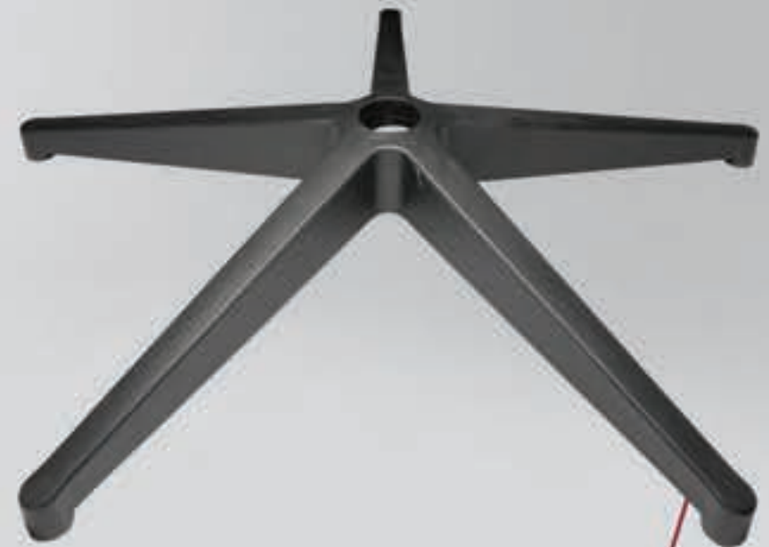
STARK BASE 28