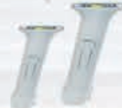
Oyo Handle - White