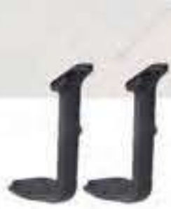
Olo Handle - Black