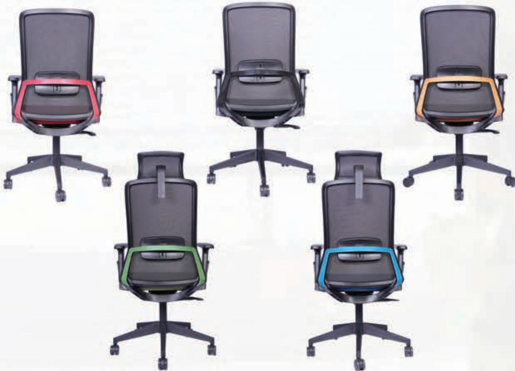
MBM InBuilt™ Components

Light as air yet incredibly sturdy, the Feather chair is designed for those who prioritize both comfort and agility. MBM India's advanced inbuilt components ensure a seamless reclining function, offering just the right amount of flexibility. Its breathable mesh back promotes airflow, preventing discomfort during extended use. The chair's high-resilience cushioning molds to the user's body, providing lasting support. Equipped with adjustable armrests and a reinforced base , your Feather is an ideal companion for dynamic workspaces.