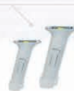
Oyo Handle - White