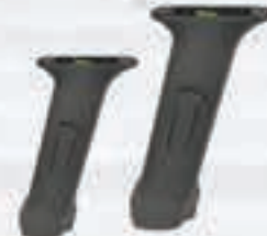
Oyo Handle - Black