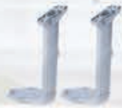
Ola Handle - White