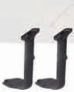
Olo Handle - Black