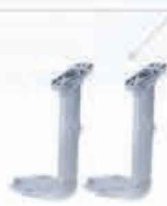
Olo Handle - White