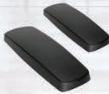
Galaxy 1 PU Pad