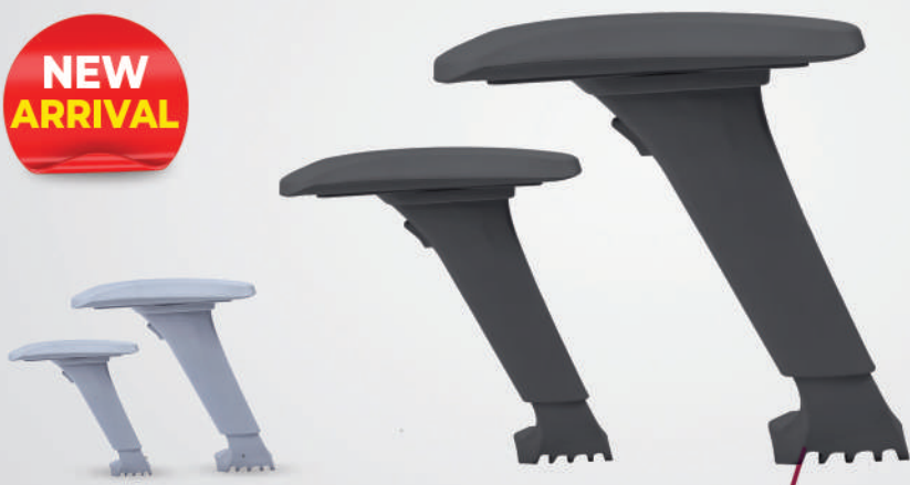
FEATHER 4D HANDLE