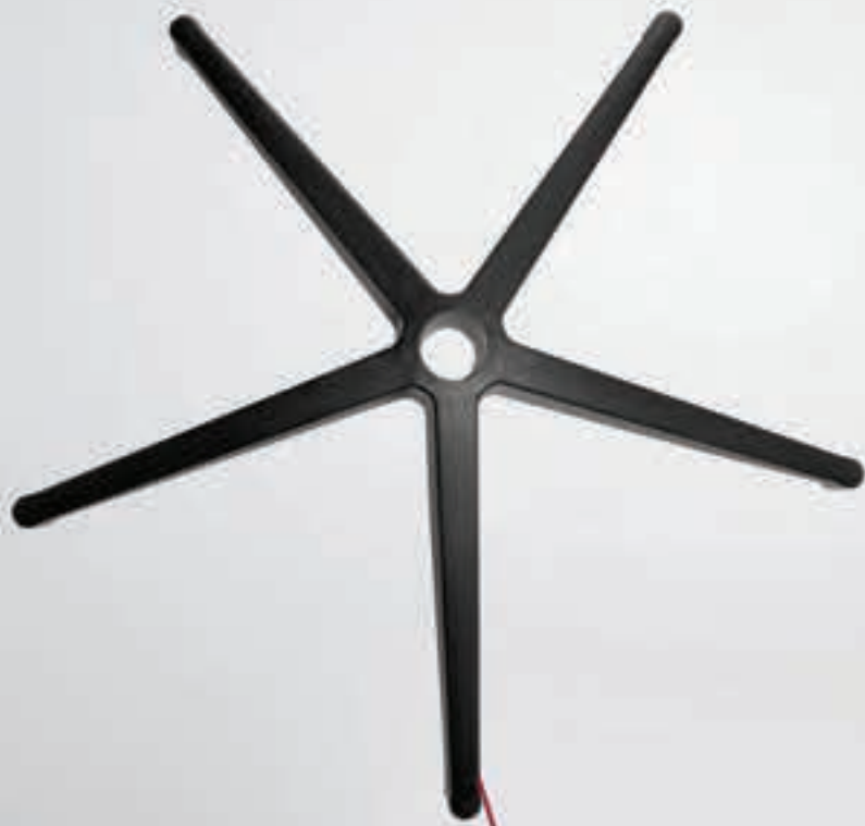
STARK BASE 26