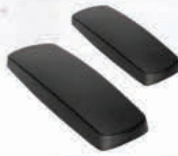
Galaxy 1 PU Pad