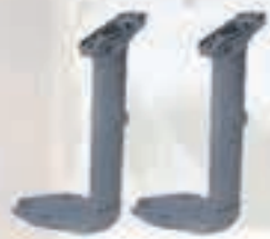
Ola Handle - Grey