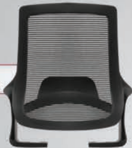
MESH BACK WITH HANDLE