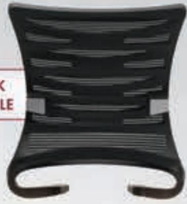
MESH BACK WITH HANDLE