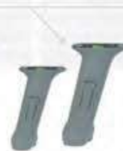
Oyo Handle - Grey