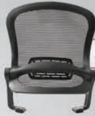
MESH BACK WITH HANDLE