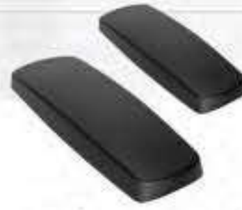
Galaxy 1 PU Pad