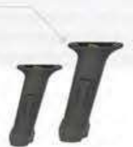
Oyo Handle - Black