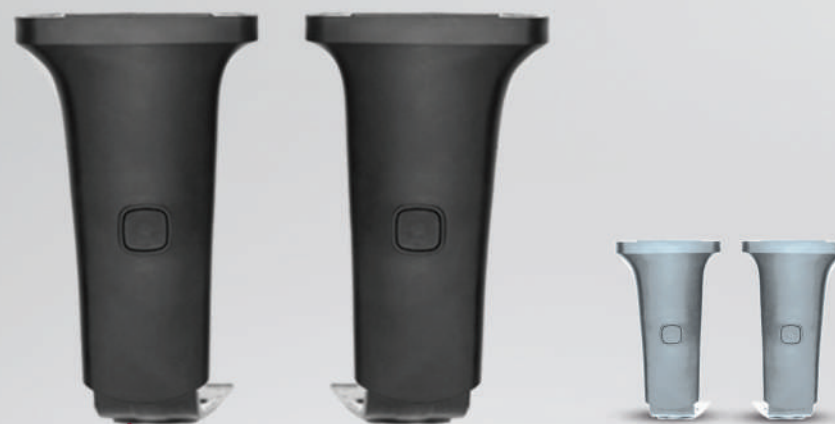
UNIQ ADJUSTABLE HANDLE