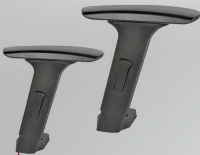
OYO HANDLE WITH 3D PAD