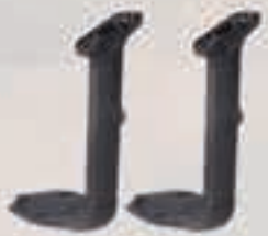
Ola Handle - Black