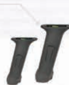
Oyo Handle - Black