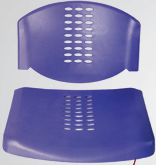
GAMMA SEAT & BACK