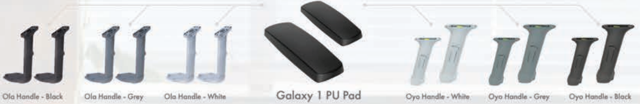
Ola Handle - Black